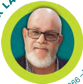
October 12, 1966 – March 12, 2024