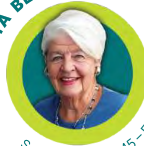
September 26, 1945 – February 22, 2024