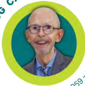
October 29, 1959 – March 25, 2024