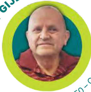
March 30, 1950 – October 22, 2023