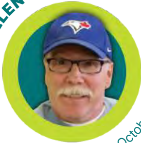
Jun 1, 1960 – October 1, 2023