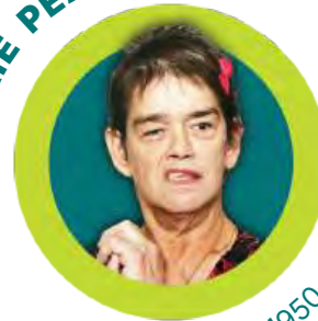
September 12, 1950 – April 22, 2024